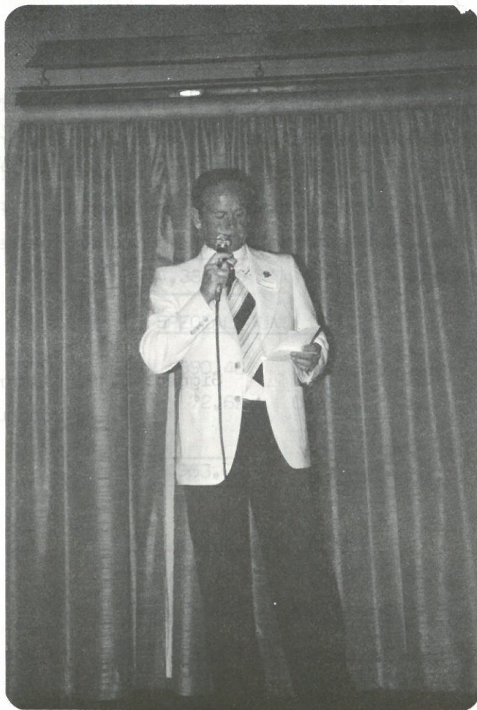
Don welcomes the guests and announces the stripper