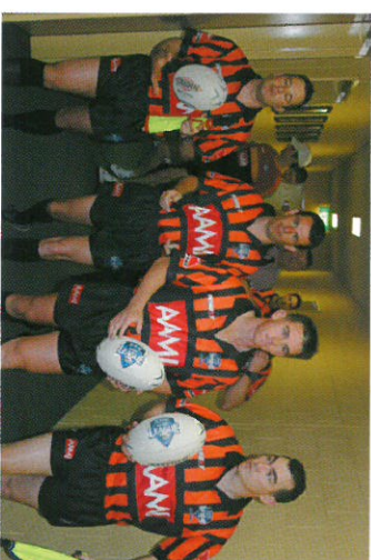
2004 PREMIER LEAGUE GRANDFINAL REFEREES