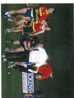
Members at our last training night