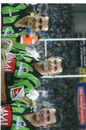
2004 NATIONAL RUGBY LEAGUE GRANDFINAL REFEREES