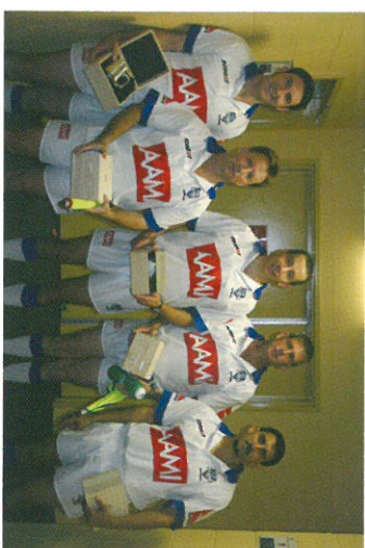
2004 JERSEY FLEGG GRANDFINAL REFEREES