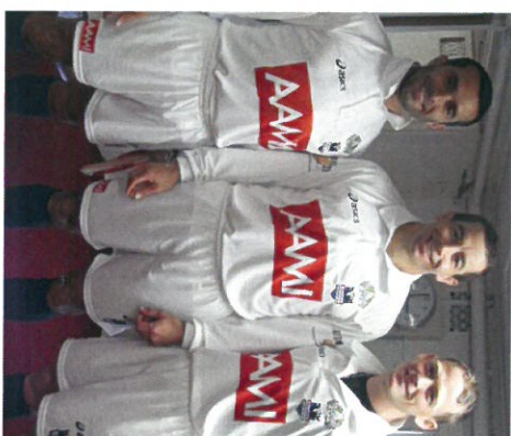
2008 Heritage Weekend