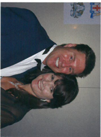
Mr & Mrs Life Member