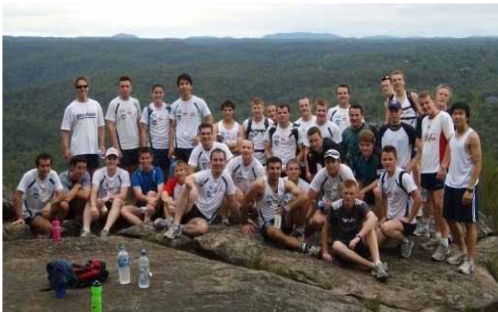
Junior Rep Squad Pre Season training session held in the Blue Mountains