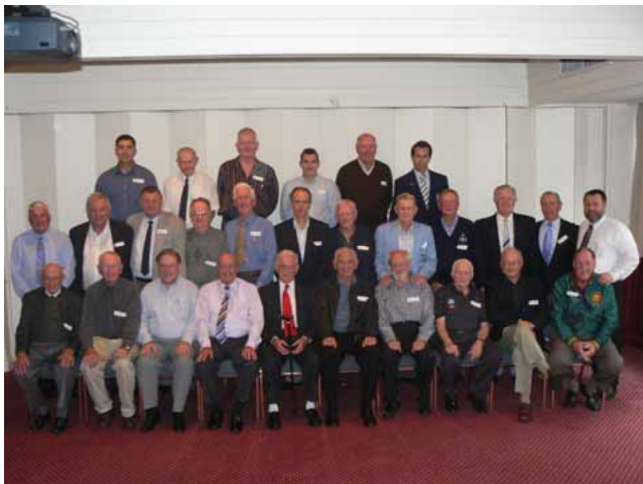
SeniorMembers at the Life/Senior Members Luncheon