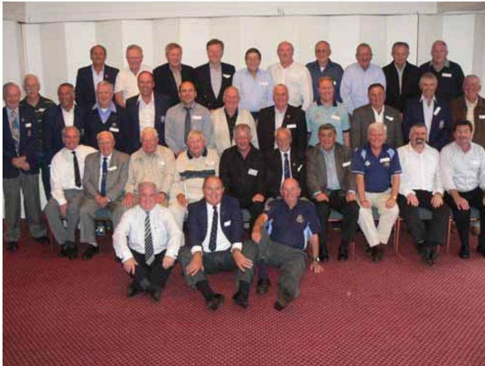
Life Members at the Life/Senior Members Luncheon