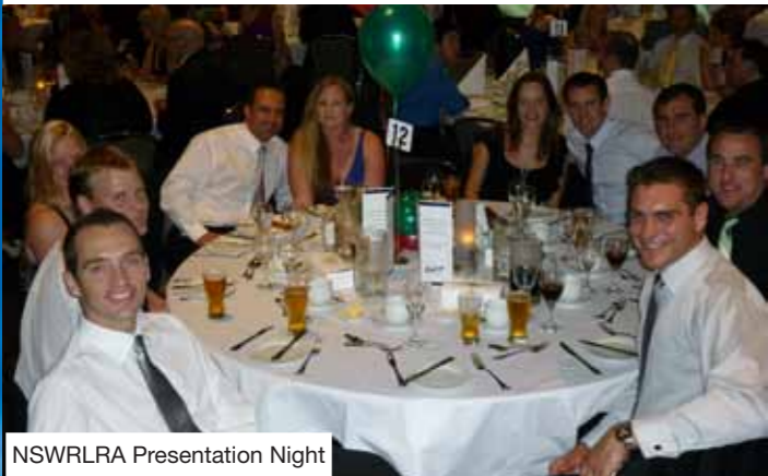
NSWRLRA Presentation Night