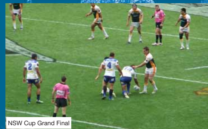
NSW Cup Grand Final