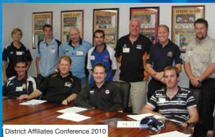
District Affiliates Conference 2010