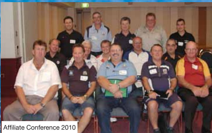
Affiliate Conference 2010