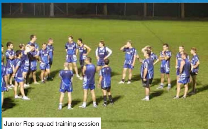
Junior Rep squad training session

I wish all members a happy festive season, and look forward to supporting the Association next season.