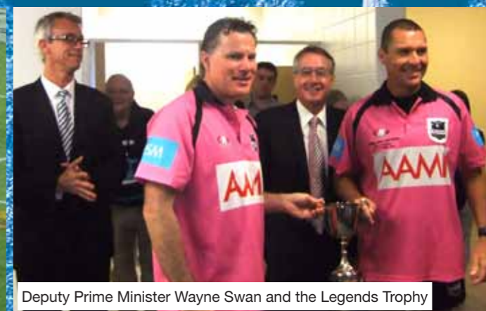
Deputy Prime Minister Wayne Swan and the Legends Trophy