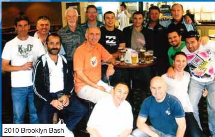
2010 Brooklyn Bash