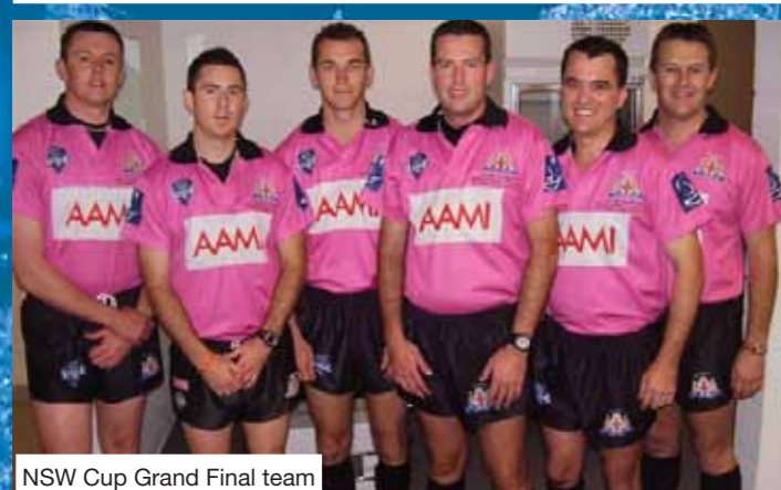
NSW Cup Grand Final team