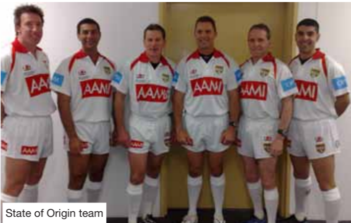
State of Origin team