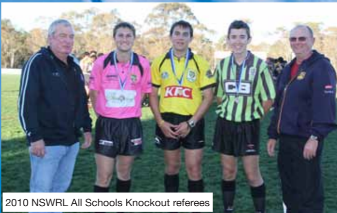
2010 NSWRL All Schools Knockout referees