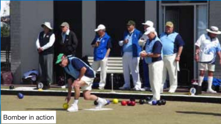
Bomber in action