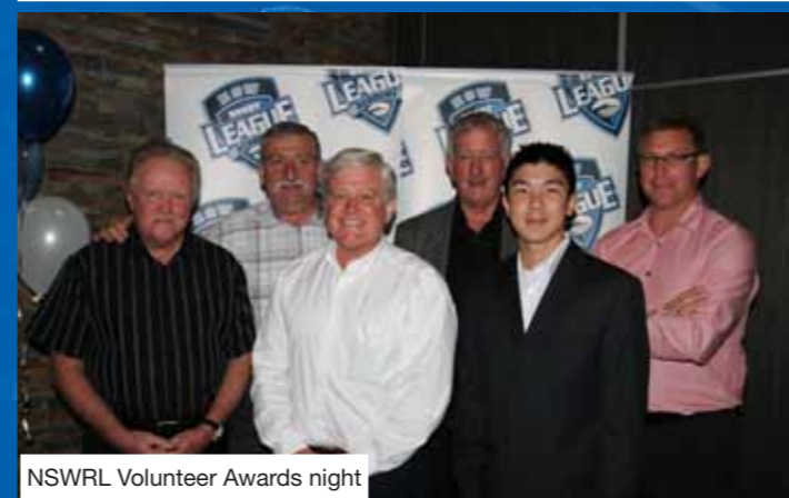
NSWRL Volunteer Awards night