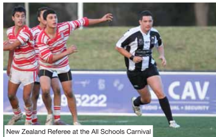
New Zealand Referee at the All Schools Carnival

So thanks to everyone I had contact with during the year and it's great to be a referee and have so many people to call as colleagues and friends working together for a great cause. I would also like to finally acknowledge the support of the Board of the NSWRLRA during the year and thank them all.