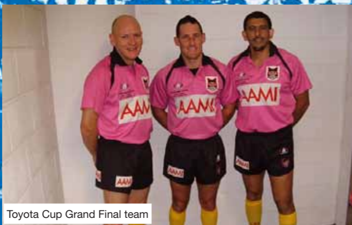
Toyota Cup Grand Final team