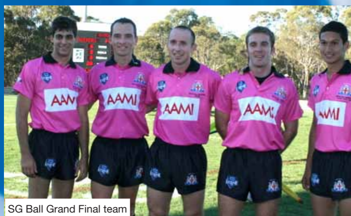
SG Ball Grand Final team