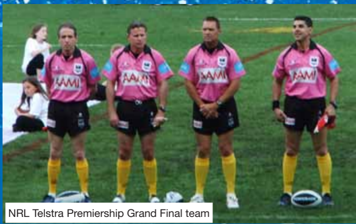
NRL Telstra Premiership Grand Final team