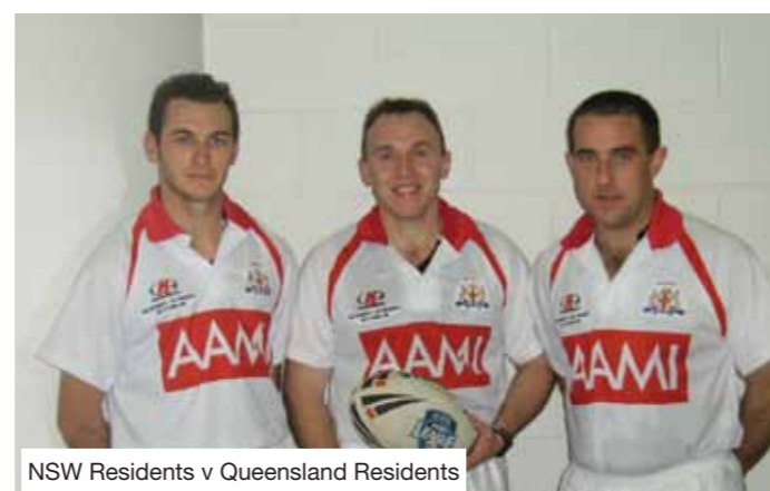
NSW Residents v Queensland Residents

I WAS DELIGHTED WITH THE PERFORMANCES OF ALL THE SQUAD THROUGHOUT SEASON 2010 CONSISTENTLY HIGH STANDARDS WERE ACHIEVED WITH ALL THE REFEREES AND S.O.'S DESPITE THE S.O.'S BEING OVERWORKED AT TIMES.