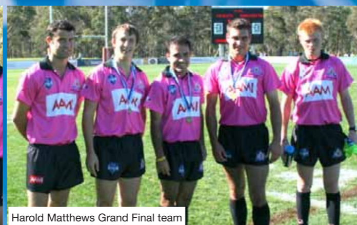
Harold Matthews Grand Final team