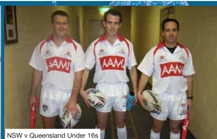
NSW v Queensland Under 16s