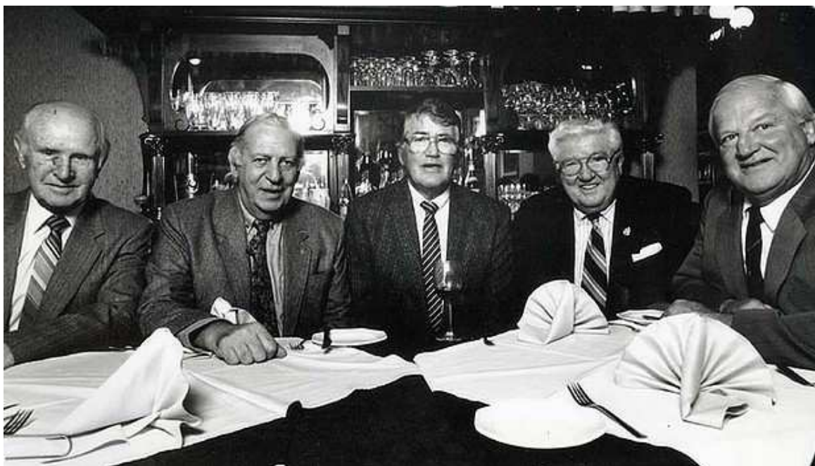
Controversy Corner panellists (from left) Col Pearce, Alan Clarkson, Rex Mossop, Ferris Ashton, and Noel Kelly.