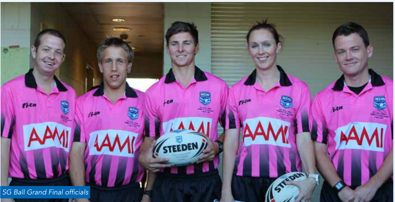
SG Ball Grand Final officials