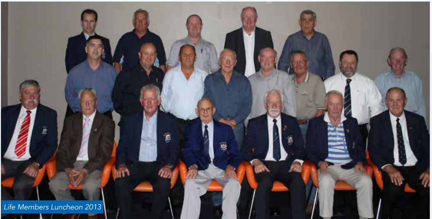
Life Members Luncheon 2013

and who support our Association and work closely together for the betterment of referees. I appreciate their support. Lastly I would like to thank the Boards of the individual Associations, who made me very welcome at their meetings; I thoroughly enjoyed giving our Association's developments and getting feedback from the meetings. To all individual referees again I thank you for your friendship.