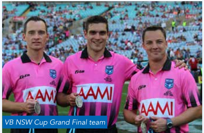
VB NSW Cup Grand Final team