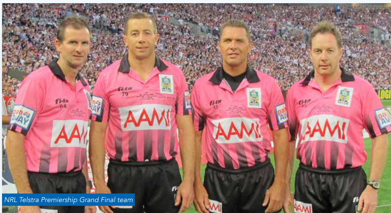
NRL Telstra Premiership Grand Final team