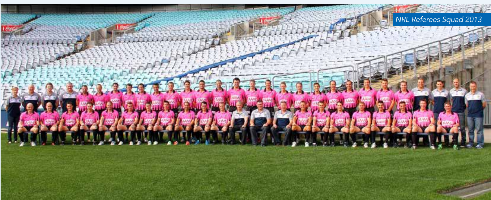
NRL Referees Squad 2013