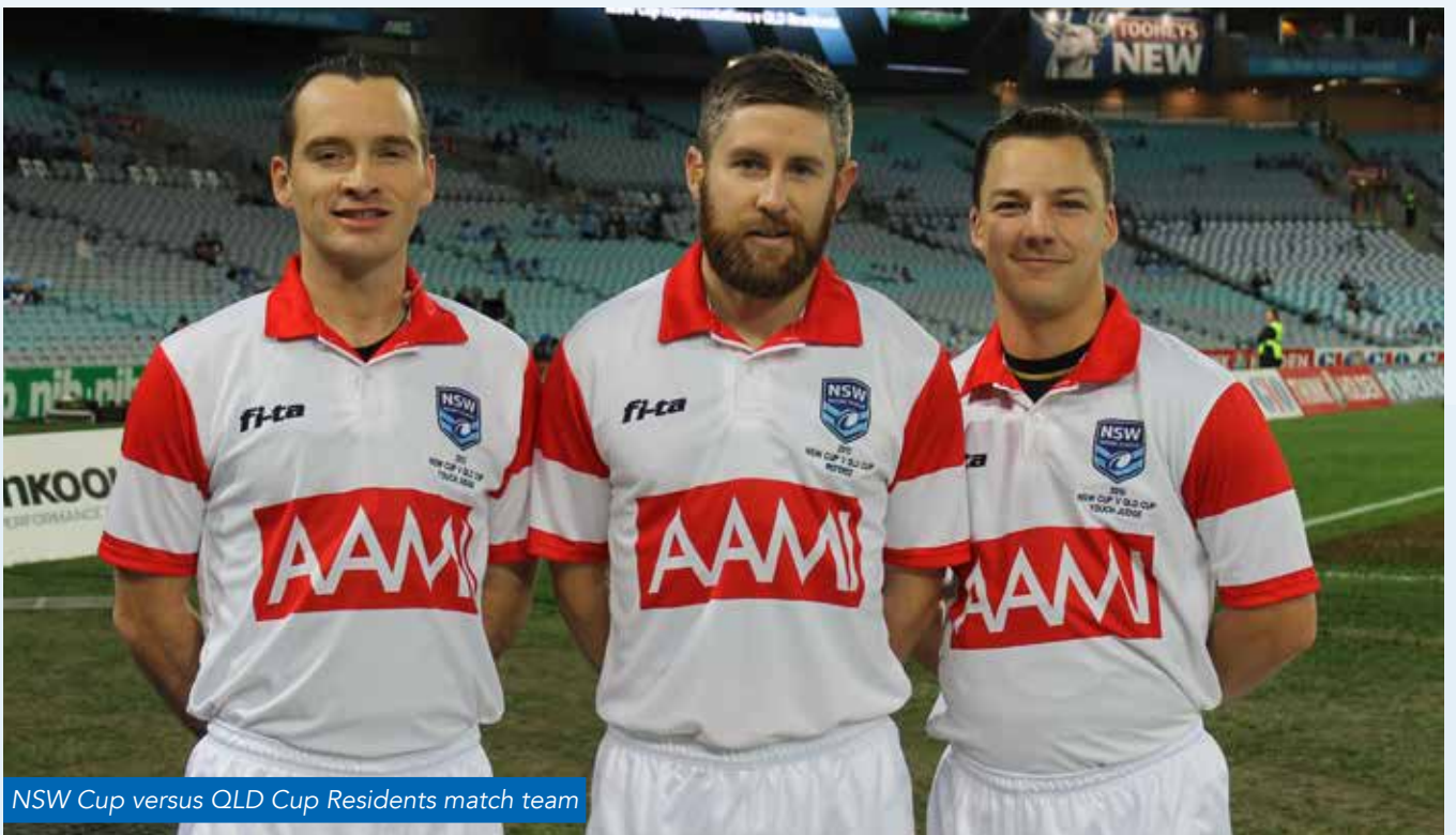
NSW Cup versus QLD Cup Residents match team