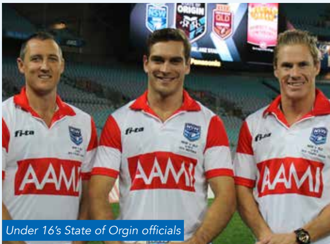
Under 16's State of Origin officials

Whilst we have had a World Cup to enjoy, it is time for a little relaxation for most of us. On behalf of the Board, may I wish everyone a happy and safe Christmas and non controversial New Year.