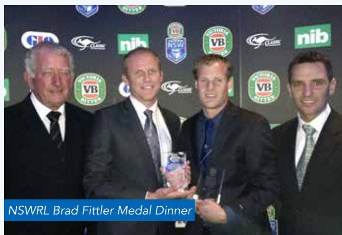
NSWRL Brad Fittler Medal Dinner