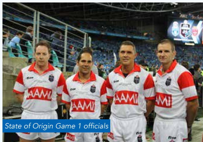
State of Origin Game 1 officials