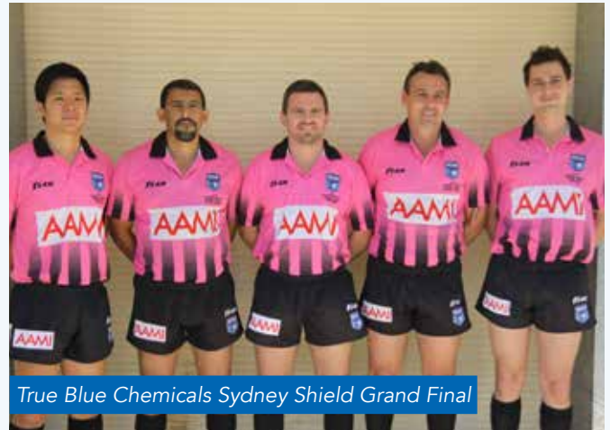
True Blue Chemicals Sydney Shield Grand Final

To all of our Active Members ,again, I look forward to working with you in season 2014, and to all our Association members a very happy joyous Christmas and New Year.