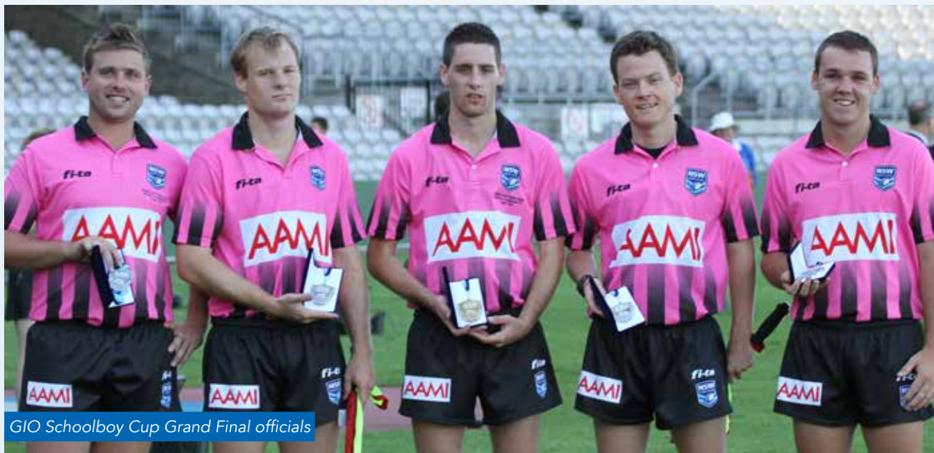
GIO Schoolboy Cup Grand Final officials