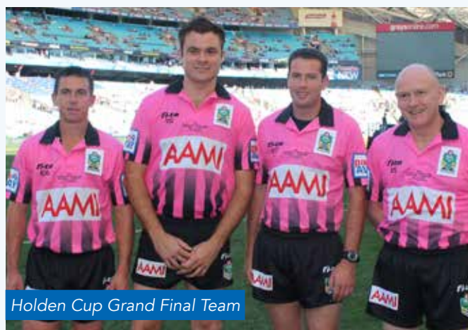
Holden Cup Grand Final Team