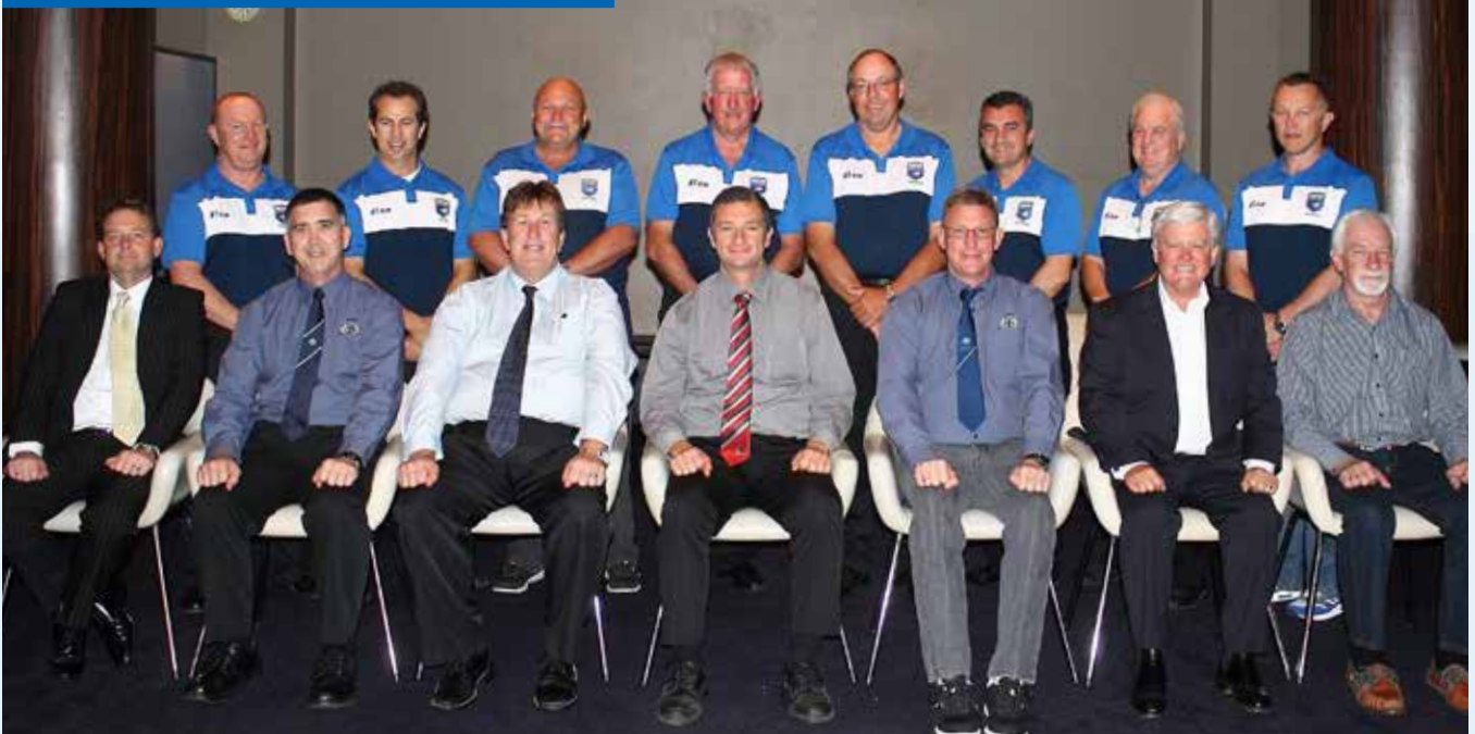
NSWRLRA Coaches and Match Day Assessors 2013

Finally, to the Executive and Committee members who give up their time in order to keep the Association moving forward in the best interest of ALL referees, your efforts are recognised and much appreciated.