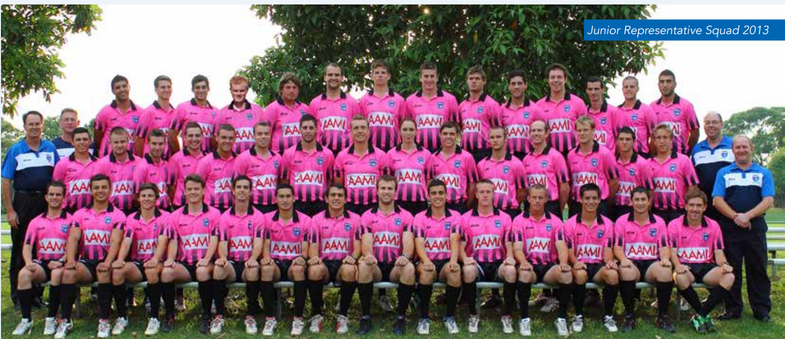
Junior Representative Squad 2013