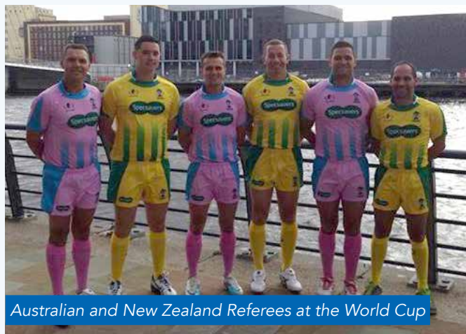
Australian and New Zealand Referees at the World Cup