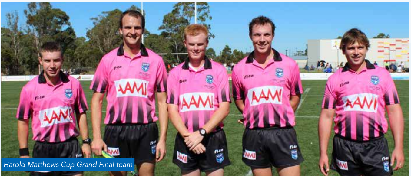
Harold Matthews Cup Grand Final team