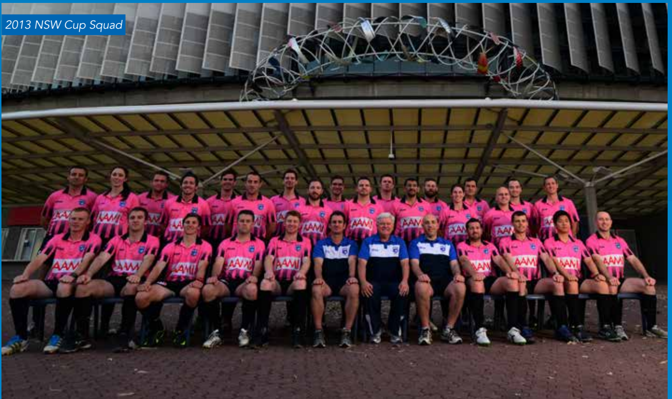
2013 NSW Cup Squad