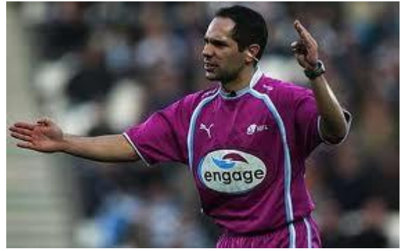
150 English Super League 2003 – 2009