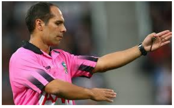
150 NRL appointments 2009 – 2014