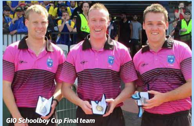
GIO Schoolboy Cup Final team

Congratulations to the squad for 2014 and best wishes in preparation for season 2015....a season that will approach very quickly without too much notice at all.