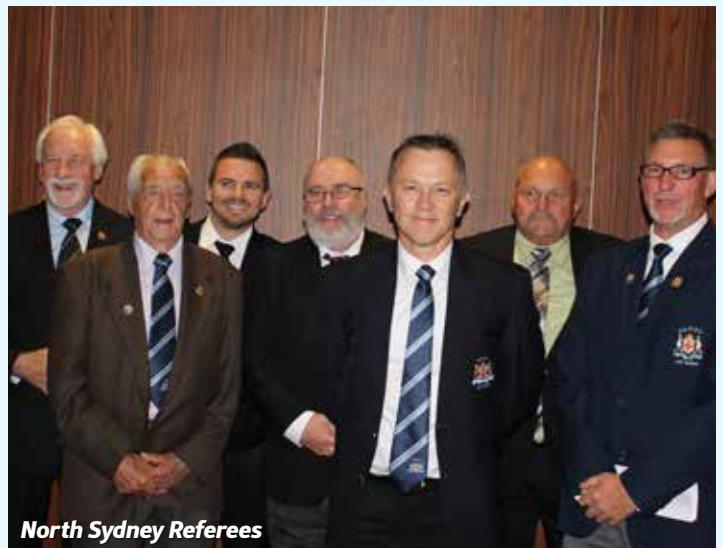
North Sydney Referees