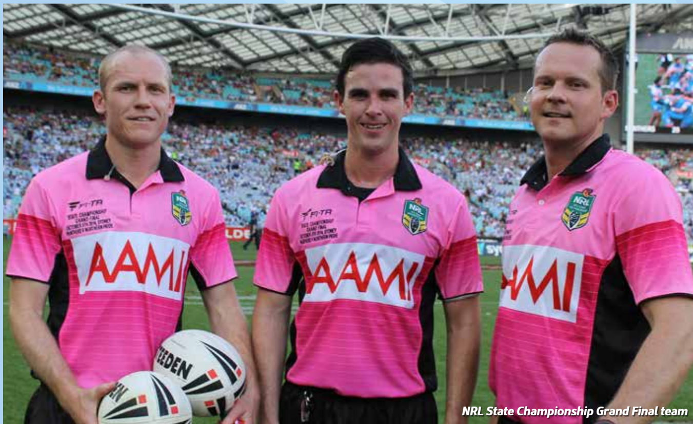
NRL State Championship Grand Final team