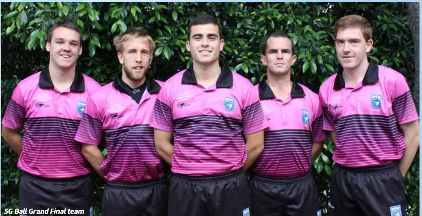
SG Ball Grand Final team