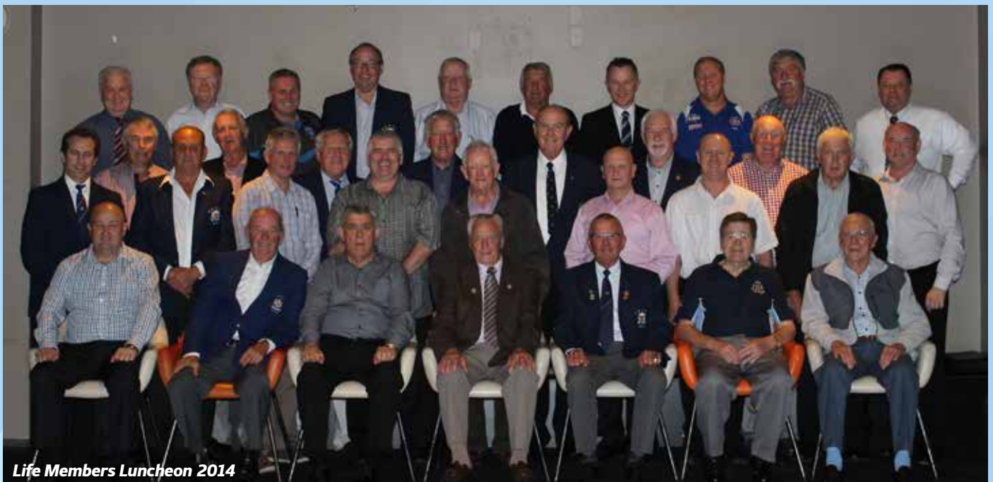
Life Members Luncheon 2014