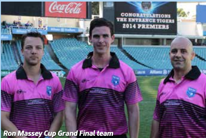
Ron Massey Cup Grand Final team