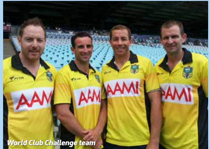
World Club Challenge team