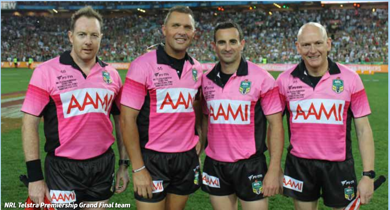
NRL Telstra Premiership Grand Final team