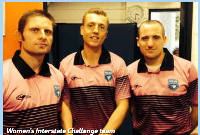
Women's Interstate Challenge team