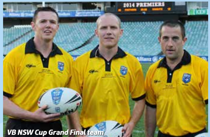
VB NSW Cup Grand Final team