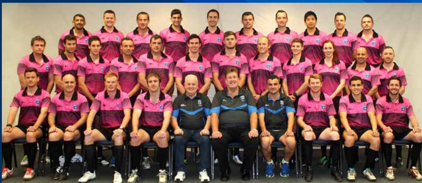
2014 NSW Cup Squad