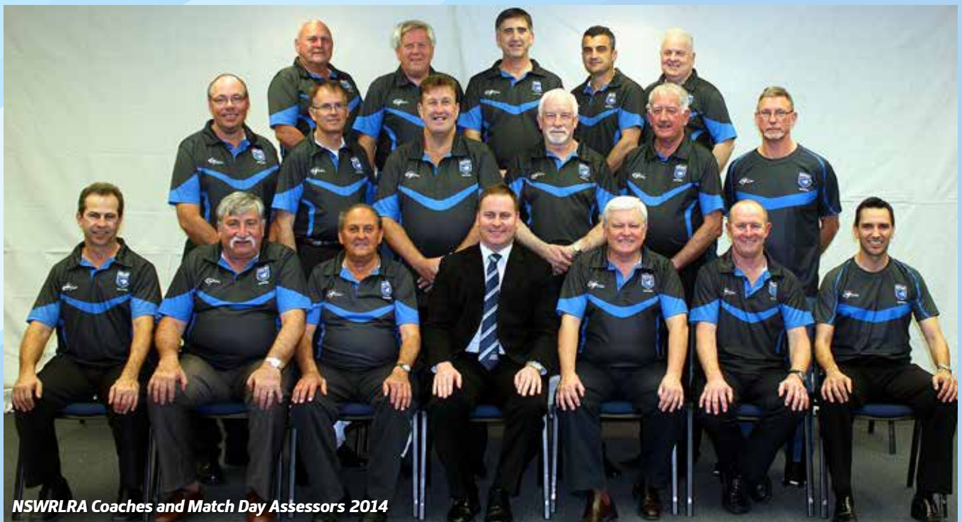
NSWRLRA Coaches and Match Day Assessors 2014

Finally, to the Board of Directors, Committee members and coaches, congratulations on another successful year. Your time and your efforts have been appreciated.