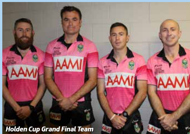
Holden Cup Grand Final Team

I congratulate all match officials for their season and look forward to working with a number of members of the NSWRLRA in the future.