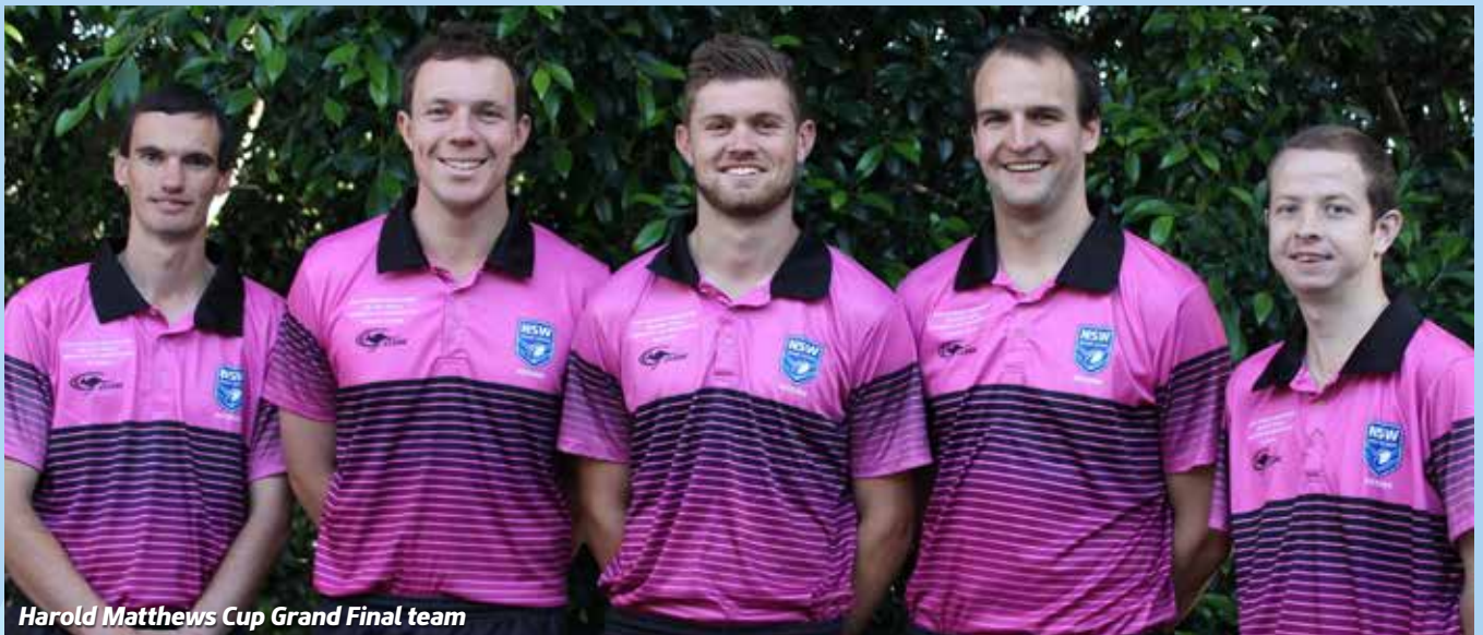
Harold Matthews Cup Grand Final team