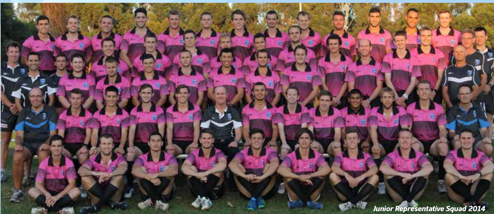
Junior Representative Squad 2014