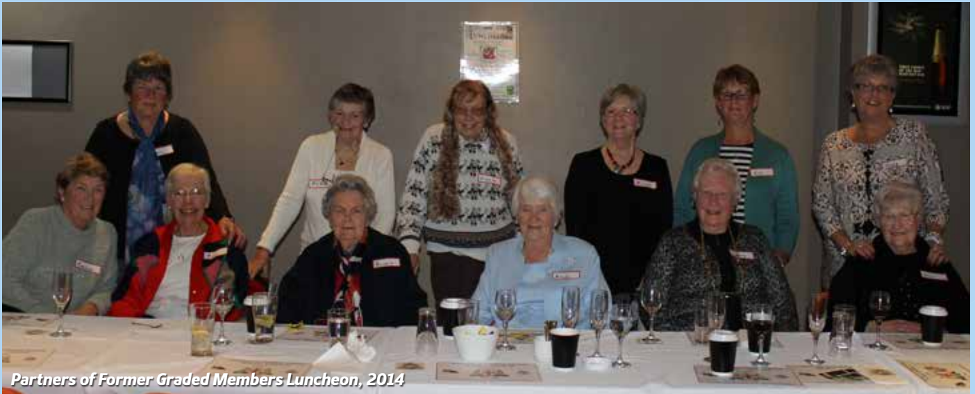
Partners of Former Graded Members Luncheon, 2014