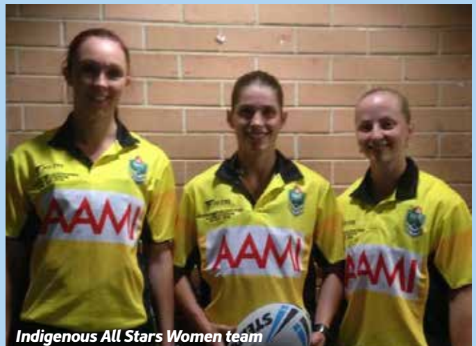
Indigenous All Stars Women team