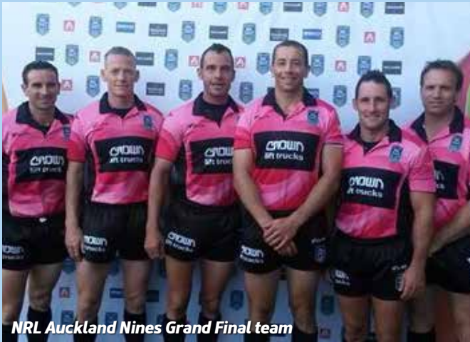
NRL Auckland Nines Grand Final team