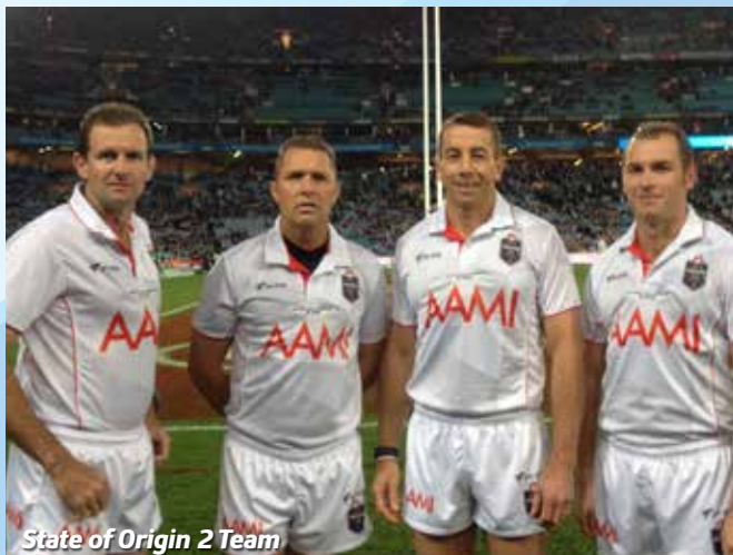
State of Origin 2 Team

I trust that the Board of the NSWRLRA has served you well this year. Enjoy your break with family and friends.