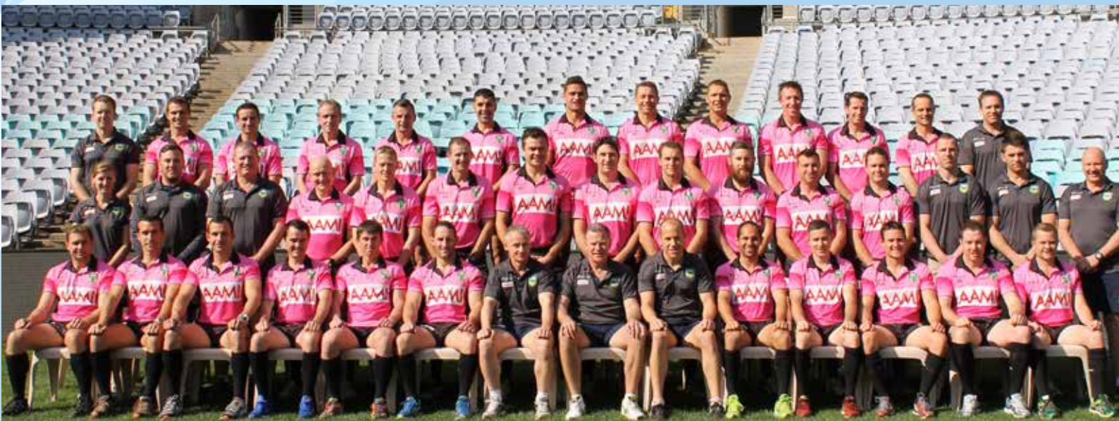
NRL Referees Squad 2014