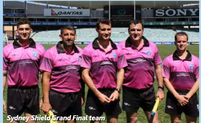
Sydney Shield Grand Final team