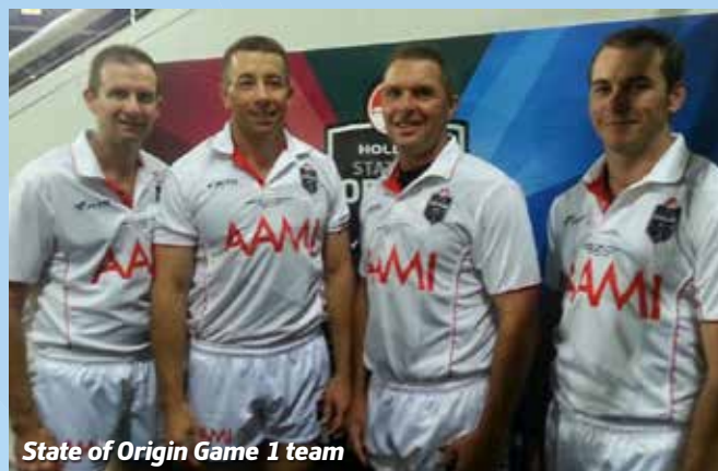
State of Origin Game 1 team

The NSW Rugby League All Schools' Carnival was another outstanding success and, again, in the interests of Referee Development two New Zealand referees, two from the Northern Territory and one from Victoria were among the ninety referees recruited for it. A feature of this year's Carnival was the attendance of ten of the NRL Referees' Squad on Day 2 to support and offer advice to the young referees officiating. Over the three days