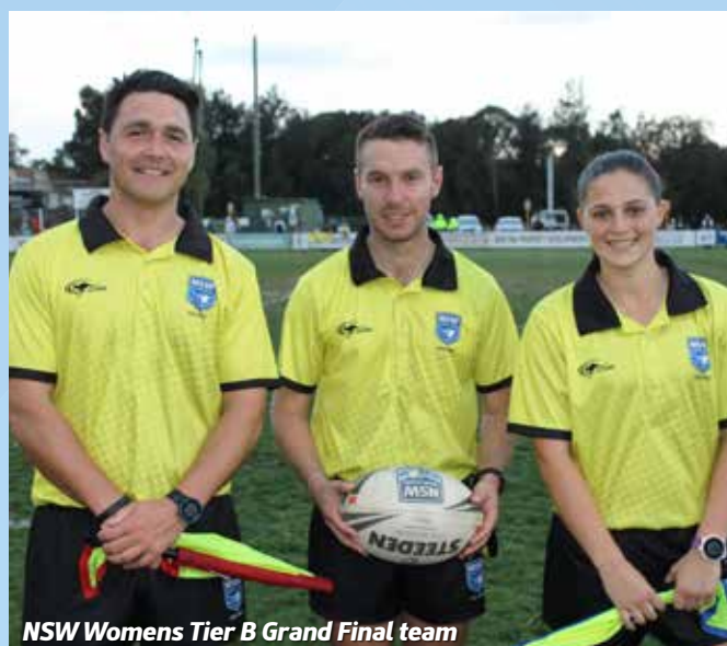
NSW Womens Tier B Grand Final team