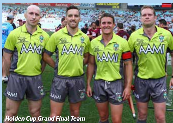
Holden Cup Grand Final Team