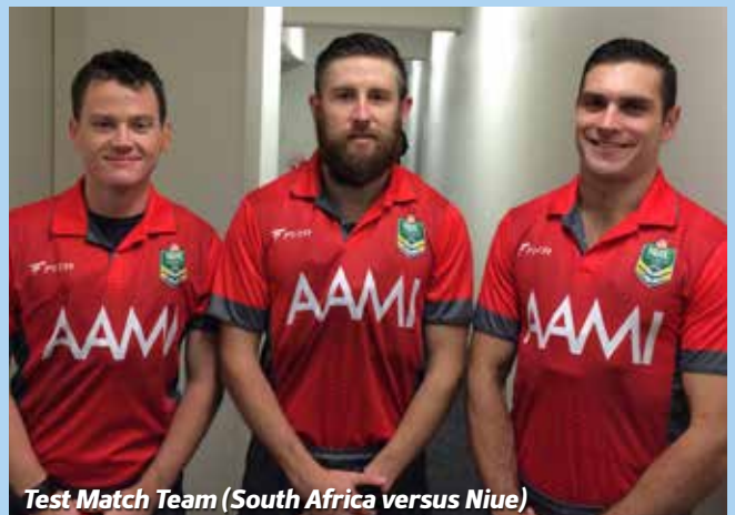
Test Match Team (South Africa versus Niue)