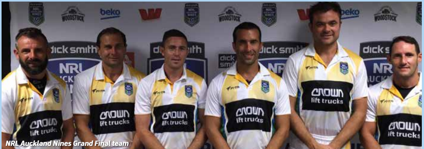
NRL Auckland Nines Grand Final team