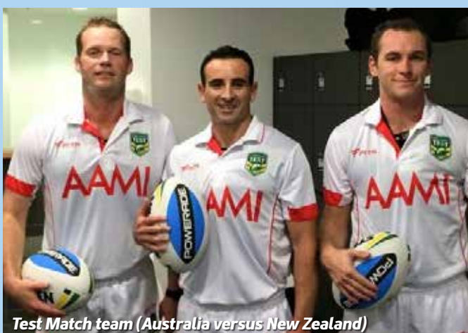
Test Match team (Australia versus New Zealand)