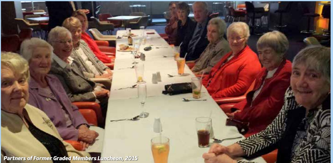
Partners of Former Graded Members Luncheon, 2015