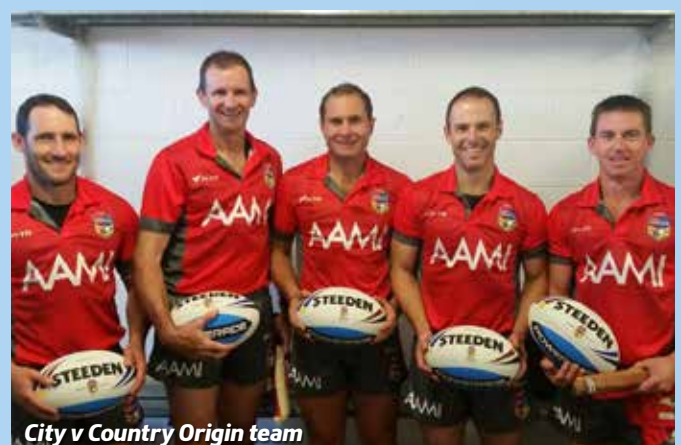
City v Country Origin team