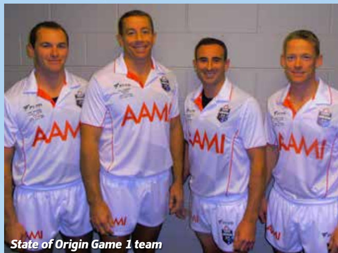
State of Origin Game 1 team

"CHANGE IS THE LAW OF LIFE. AND THOSE WHO LOOK ONLY TO THE PAST OR PRESENT ARE CERTAIN TO MISS THE FUTURE"