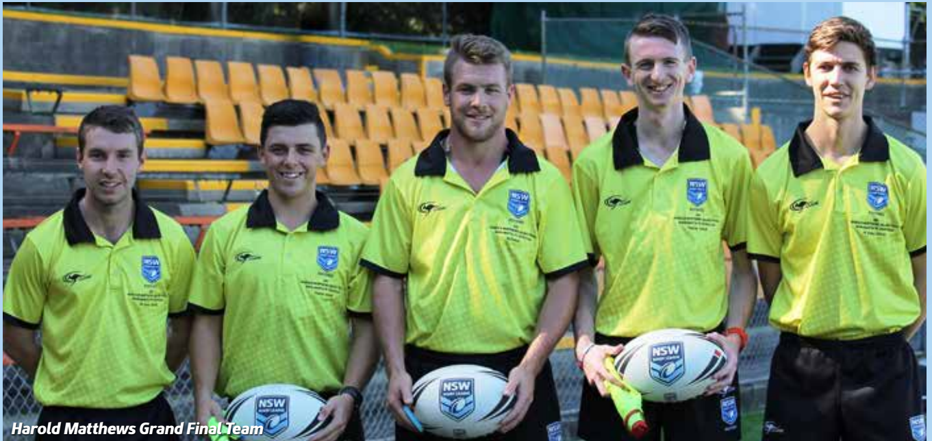
Harold Matthews Grand Final Team