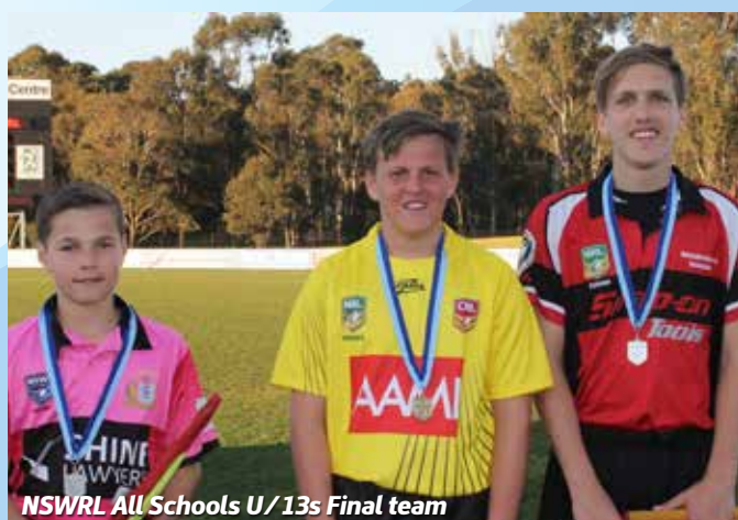
NSWRL All Schools U/13s Final team