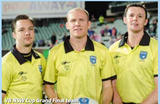
VB NSW Cup Grand Final team