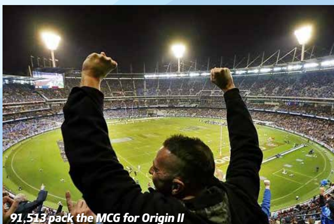
91,513 pack the MCG for Origin II