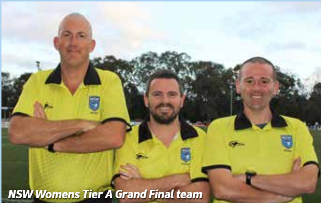
NSW Womens Tier A Grand Final team