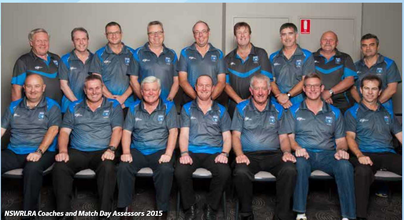
NSWRLRA Coaches and Match Day Assessors 2015

We wish you all a pleasant, although brief break from the game and a prosperous festive season. Train hard and “bunker down” for what will no doubt be yet another interesting season ahead.