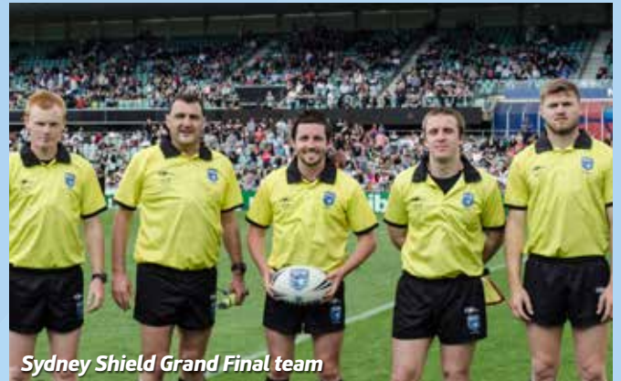
Sydney Shield Grand Final team