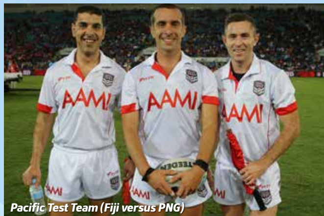
Pacific Test Team (Fiji versus PNG)