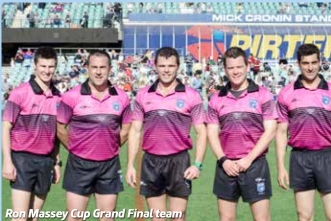
Ron Massey Cup Grand Final team