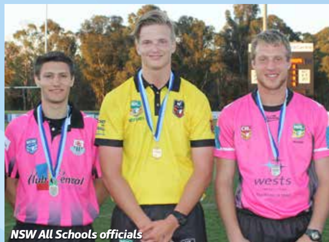
NSW All Schools officials