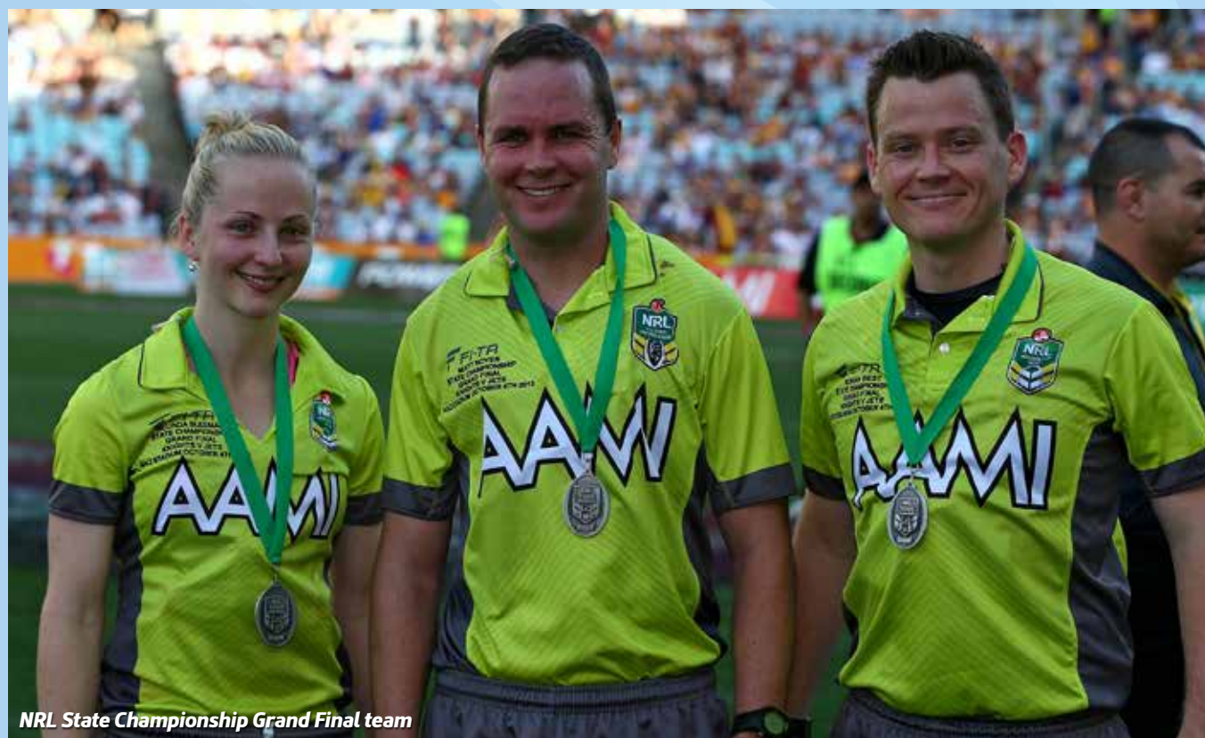
NRL State Championship Grand Final team