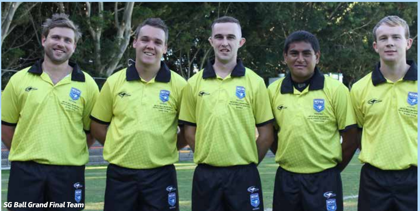
SG Ball Grand Final Team