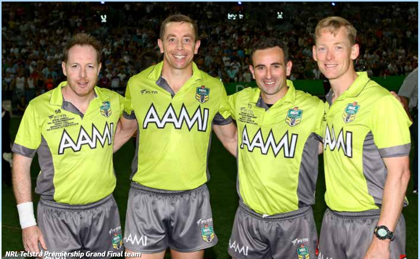
NRL Telstra Premiership Grand Final team