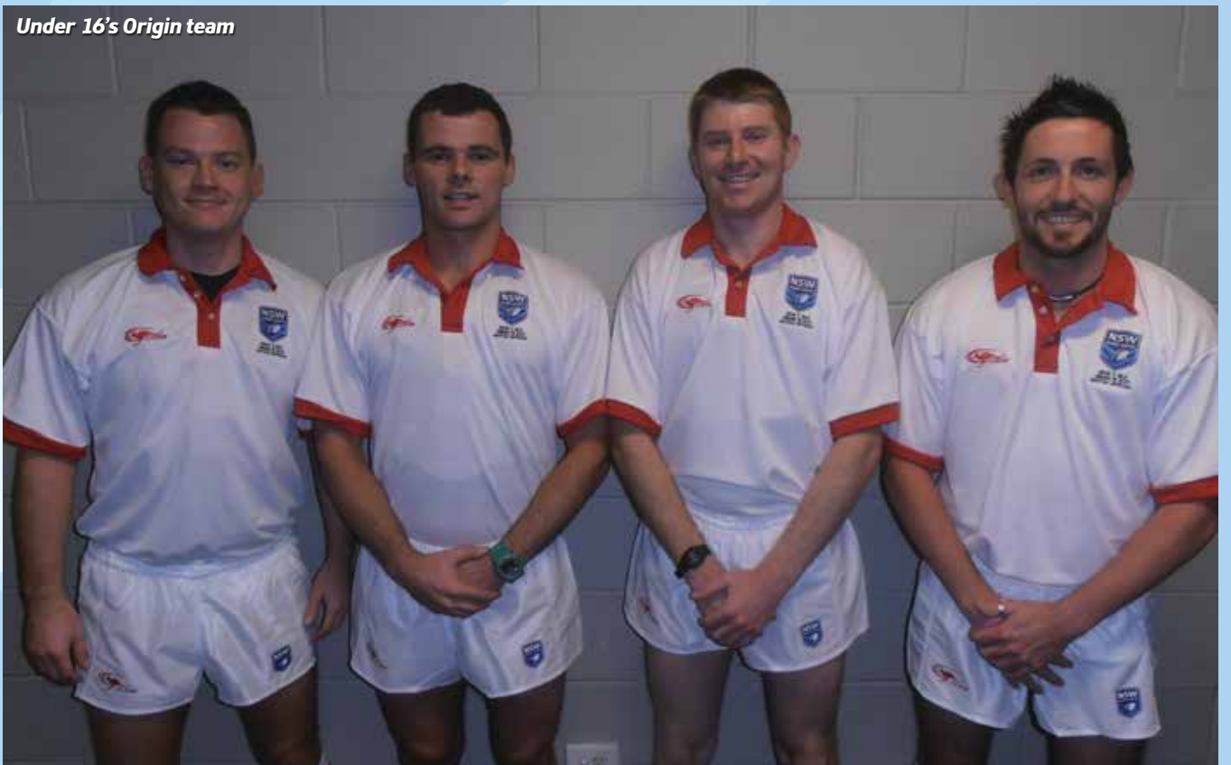
Under 16's Origin team