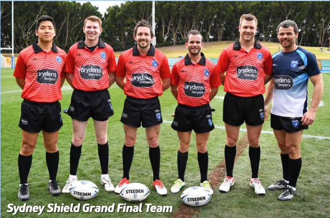
Sydney Shield Grand Final Team