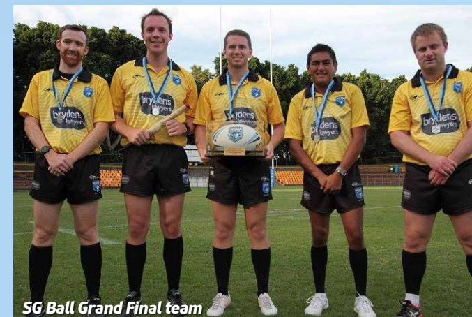
SG Ball Grand Final team