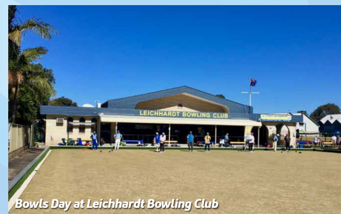
Bowls Day at Leichhardt Bowling Club

Unfortunately, due to increased pressures and commitments at work, I won't be standing for the Board again for the 2017/18 season. I have thoroughly enjoyed the last 2 years and hope that I have added some value to the Association in that time. Thank you to all the members for your support. I will still be around and hopefully attending as many functions as I can.