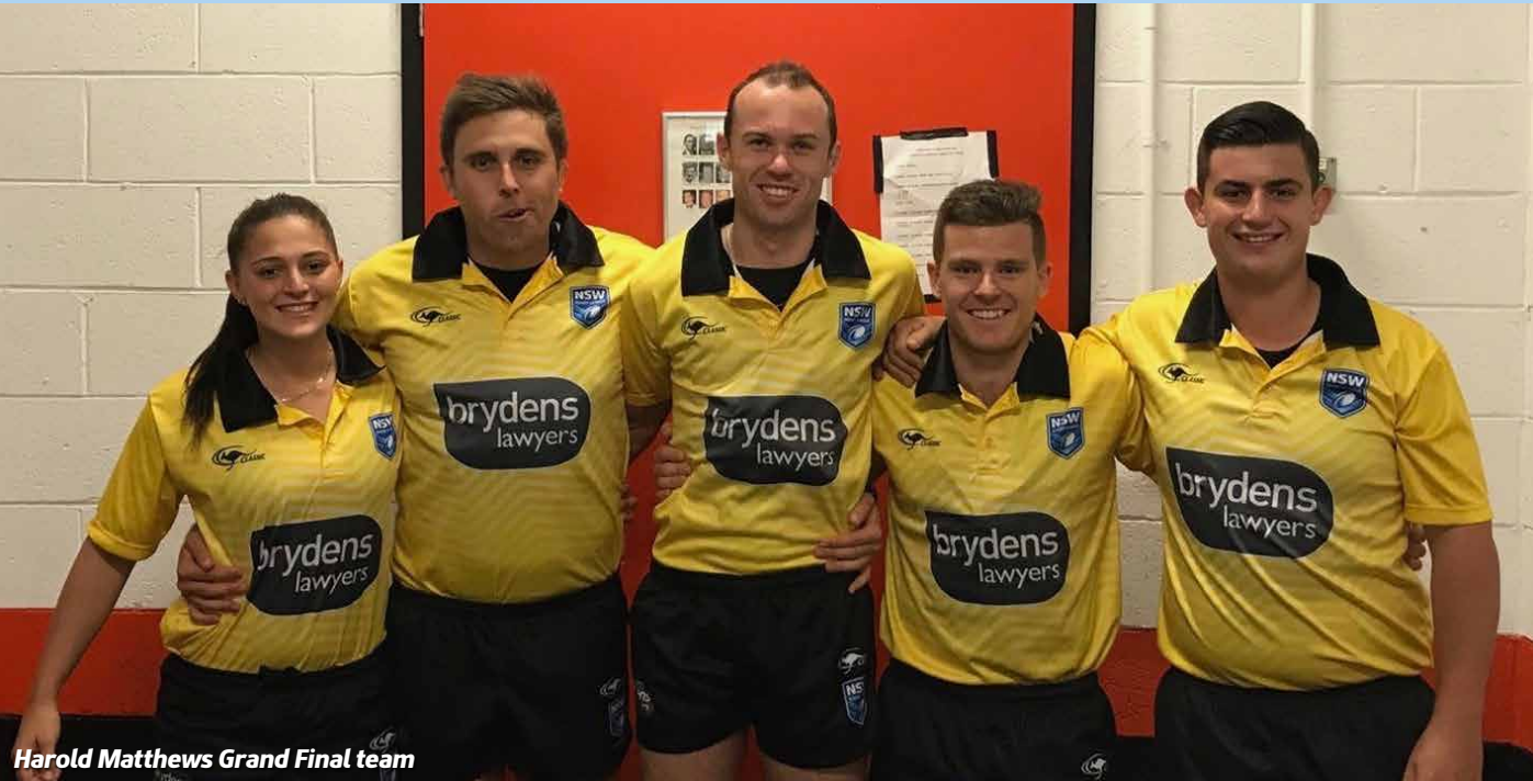
Harold Matthews Grand Final team