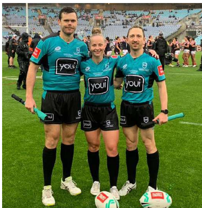
NRL Women's Grand Final Referees

May I wish everyone in officiating, at all levels of the game, a very successful, satisfying and much more normal 2021 season.