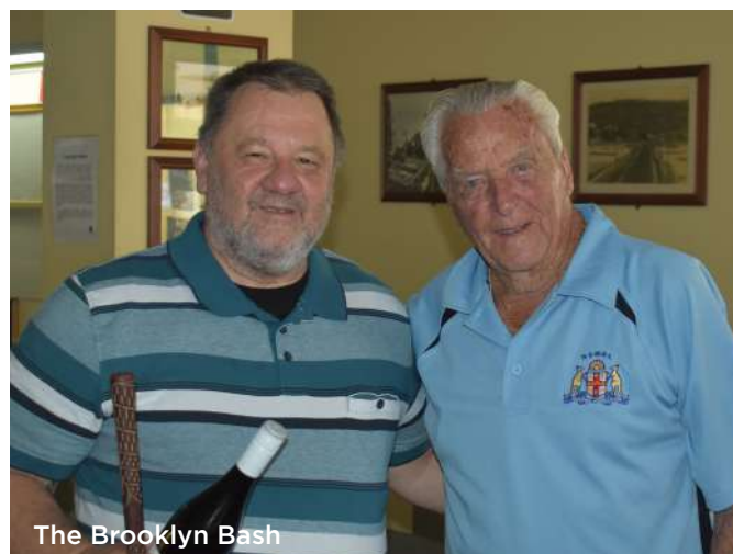
The Brooklyn Bash

Covid-19 had a significant affect on our ability to host events and some important events such as the Life Members Luncheon and the Luncheon for the partners of past members simply could not be held. We will have those events back on the calendar as soon as possible.