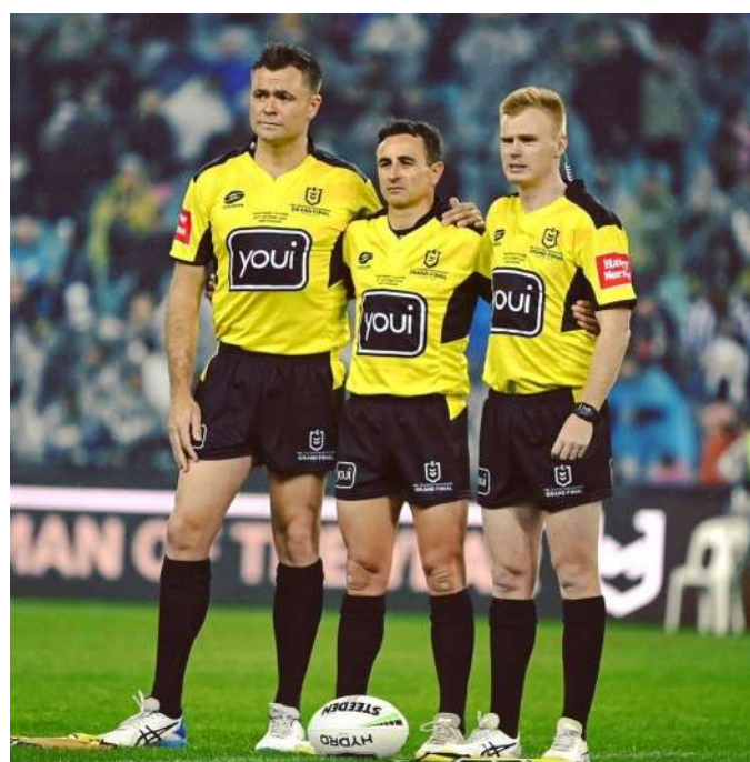
NRL Grand Final Referees