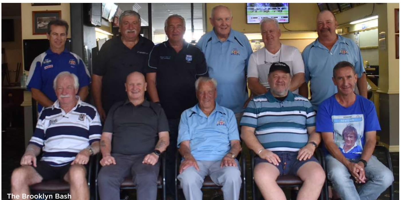
The Brooklyn Bash

To date, 1025 referees have been graded along that journey.