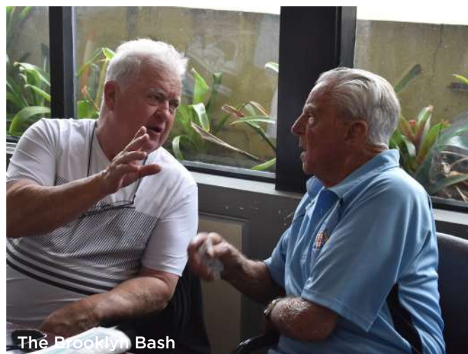
The Brooklyn Bash