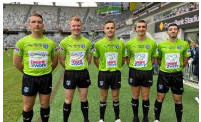
SG Ball Cup Referees