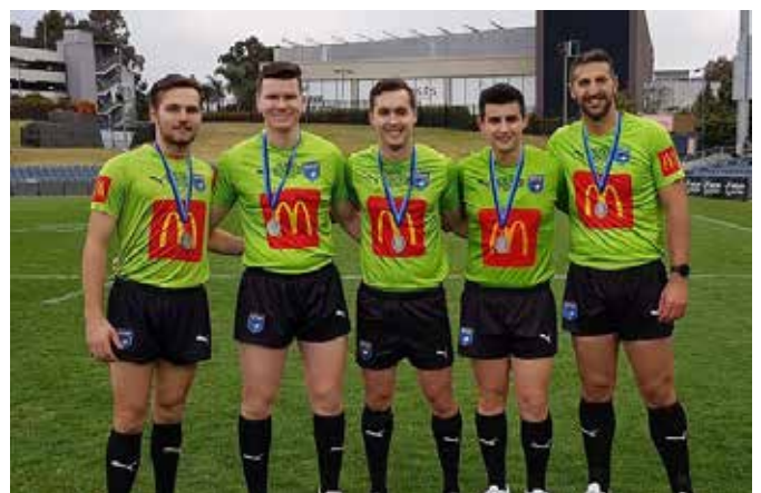
Harvey Norman Women's Grand Final Referees