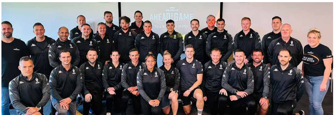
World Cup Squad 2022