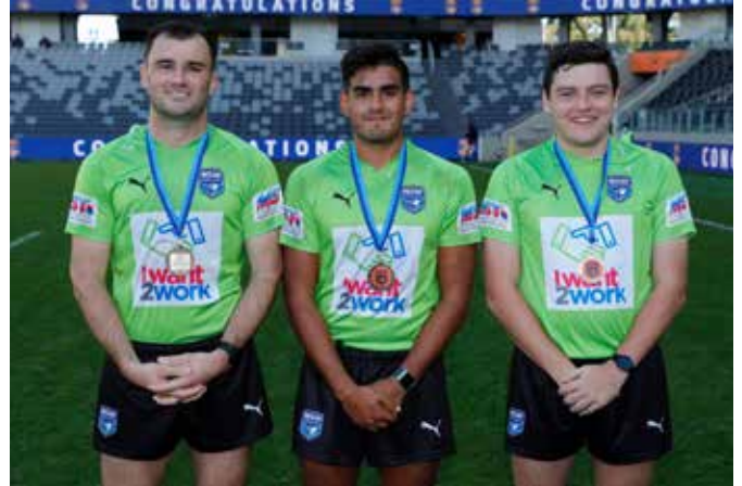
City v Country U18's