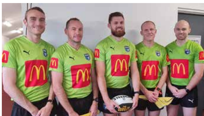
Knock On Effect NSW Cup Grand Final Referees