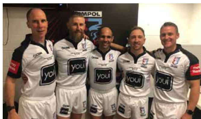
Origin 3 Referees