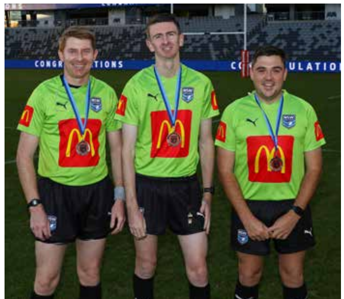
City v Country Women's