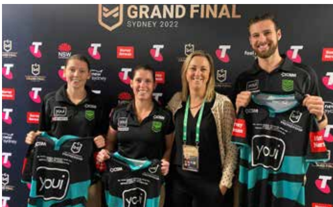
NRL Women's Grand Final Referees