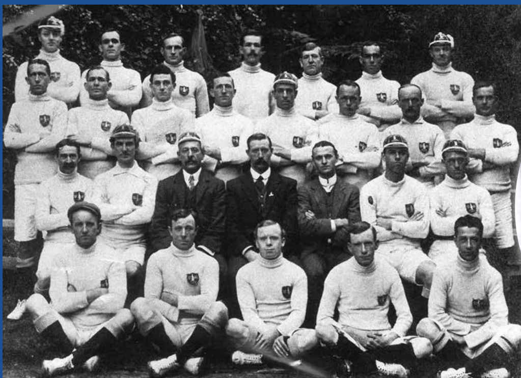
1909 Referees Squad