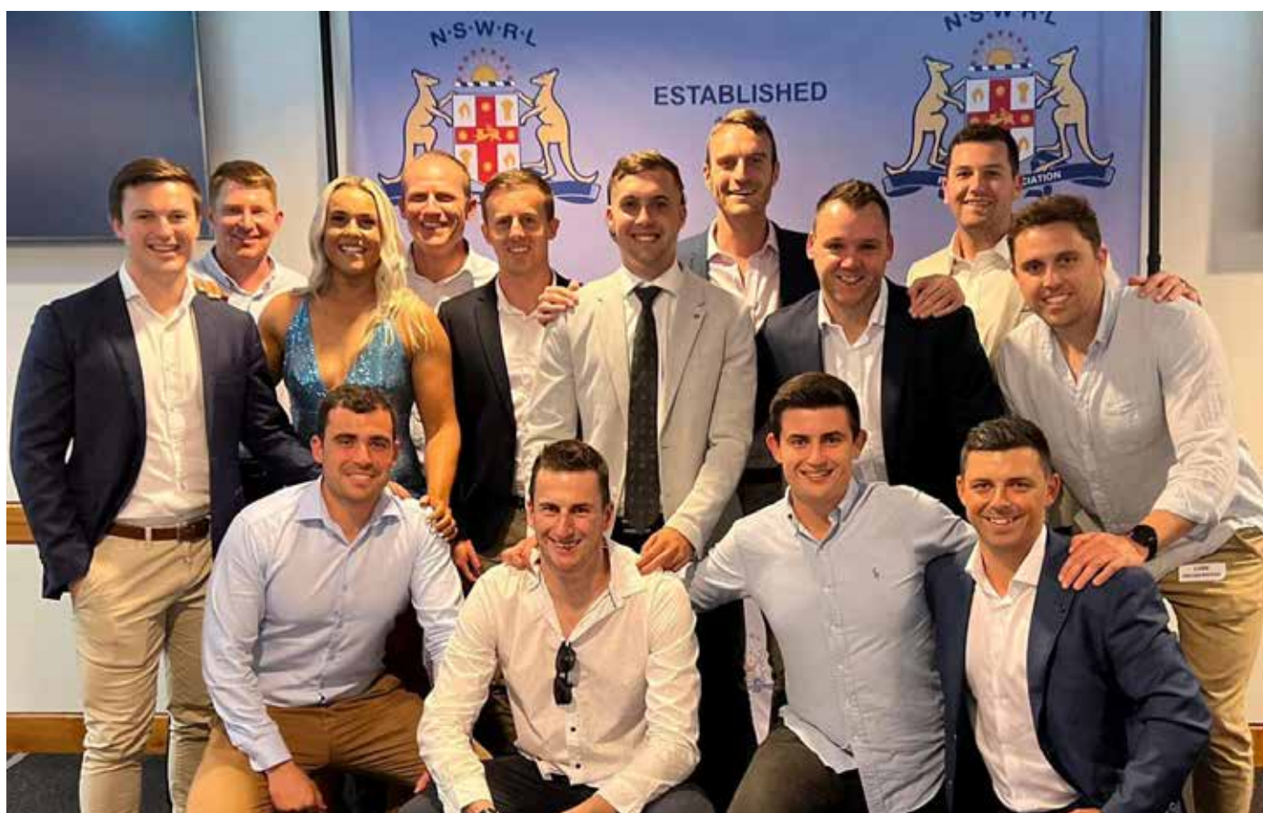
Grade Referees at NSWRLRA Life Members Lunch