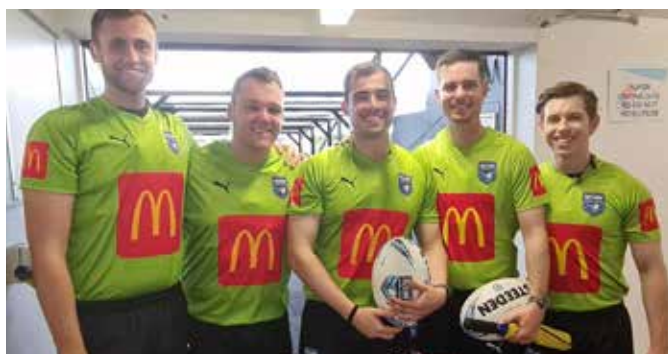
Jersey Flegg Grand Final Referees