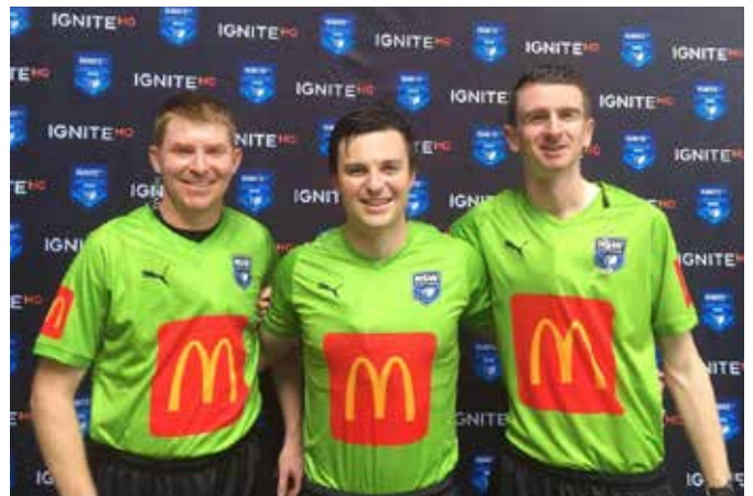
City v Country Men's