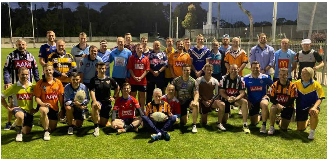
NSWRLRA Graded Squad 2022

As we head into 2023 there are a few unknowns regarding competitions structure etc, but I do know that we will have all our officials prepared and ready for any challenge thrown at them.