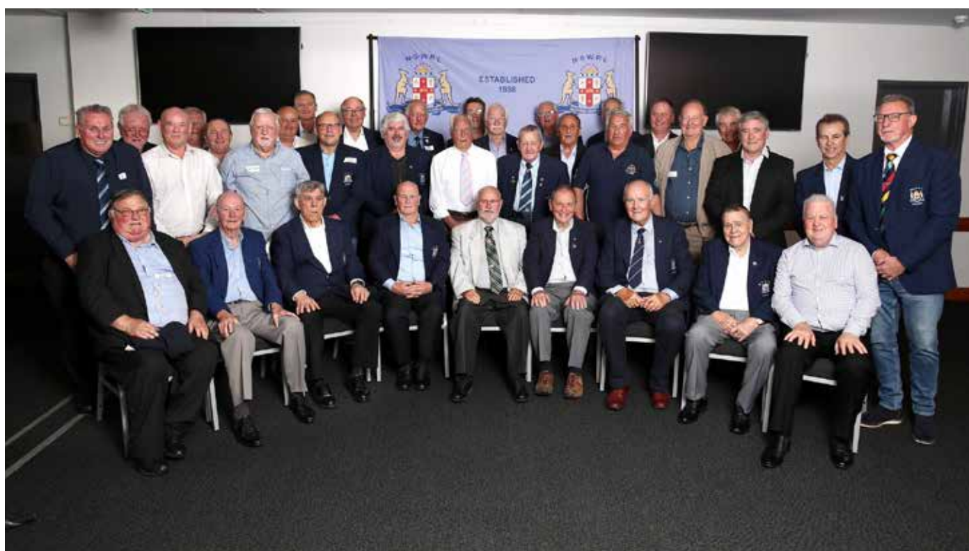
Life Members Luncheon Group