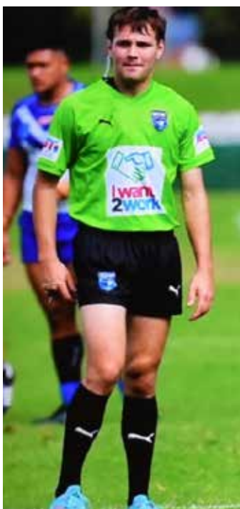
#1029 Ethan Klein