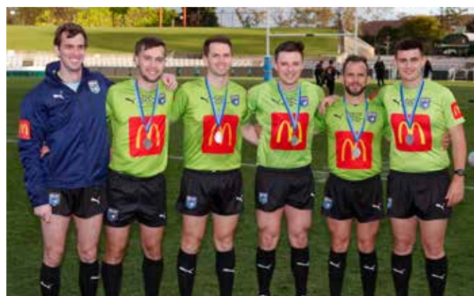
NSWRL Ron Massey Cup Grand Final Referees