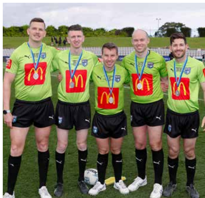
NSWRL Sydney Shield Grand Final Referees