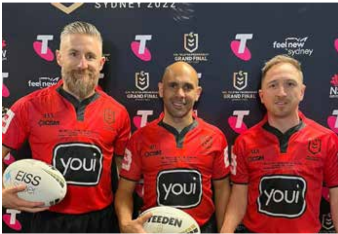
NRL Men's Grand Final Referees