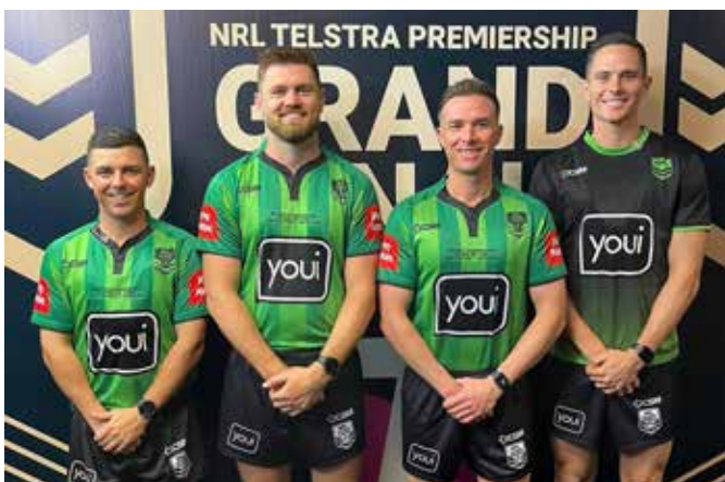
NRL State Championship Referees